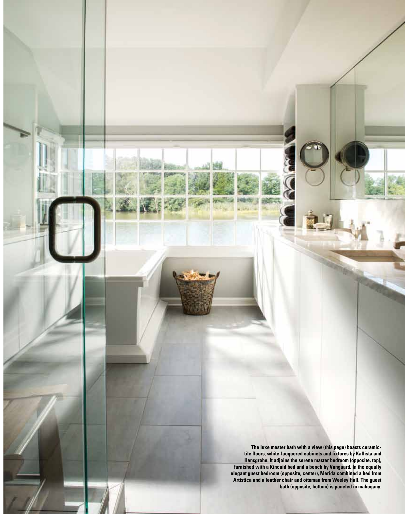
The luxe master bath with a view (this page) boasts ceramic-tile floors, white-lacquered cabinets and fixtures by Kallista and Hansgrohe. It adjoins the serene master bedroom (opposite, top), furnished with a Kincaid bed and a bench by Vanguard. In the equally elegant guest bedroom (opposite, center), Merida combined a bed from Artistica and a leather chair and ottoman from Wesley Hall. The guest bath (opposite, bottom) is paneled in mahogany.